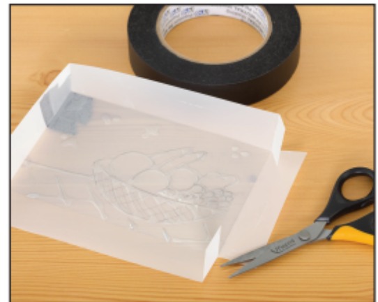
Step 2: Cut corners and fold into a box.