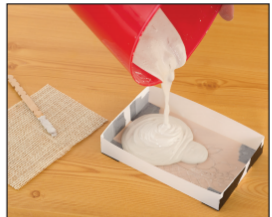
Step 3: Mix plaster and pour into mold.