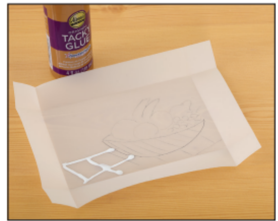
Step 1: Use glue to paint image.